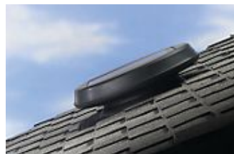
This sleek, unobtrusive design is for most roof applications